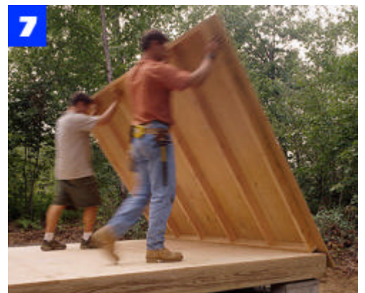
Carefully raise the end wall into position. Note how the plywood siding hangs down to cover the floor framing.

Cover the trusses with 1/2-in. CDX plywood, then nail on the asphalt roof shingles (Photo 11).