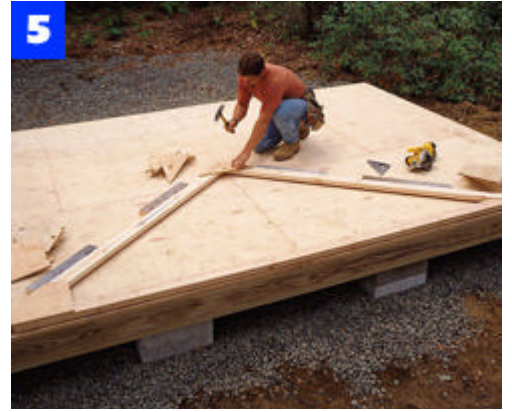
Assemble all of the roof trusses on the shed floor. Nail plywood gussets across the joints on both sides of the trusses.