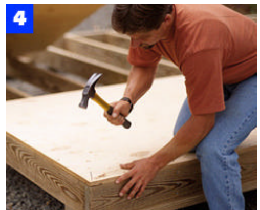
Use 3/4-in. exterior-grade, tongue-and-groove plywood for the floor. Secure the plywood to the frame with 8d nails.