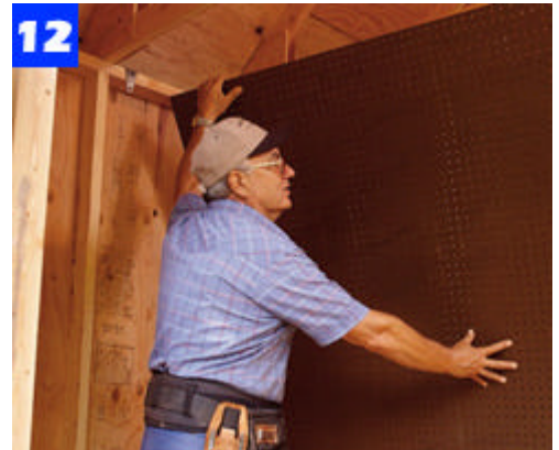
Install perforated hardboard to the partition wall in the tool-storage area. Fasten it with 1-1/4-in. screws.

The textured plywood siding we installed came with a factory-applied coat of primer. We finished it with two coats of barn-red acrylic latex paint. If you would prefer to stain your shed, be sure to buy unprimed plywood siding.