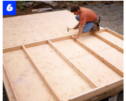
Build the exterior walls on the floor. Assemble the 2 x 4s with 16d nails and then add the plywood sheathing.

Tilt the wall up into place (Photo 7) and secure it with 3-in. deck screws (Photo 8). Frame and erect the rear wall, followed by the front wall. Then, install the interior partition. If you're including a playroom, as we did, cover the partition side that faces that room with plywood, and screw it in place. Then install the final wall.