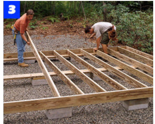
Install a 2 x 6 floor joist every 16 in. Fasten them by nailing through the band joists with 16d galvanized nails.