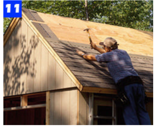
Cover the plywood roof sheathing with asphalt shingles. Eight bundles are needed to complete this roof.