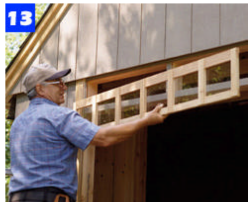
Make the 5-ft.-long transom window from a wooden frame and a single piece of glass. Install it over the end doors.