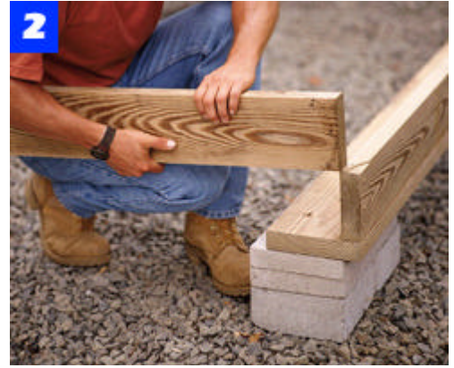
Set the 2 x 6 floor joists on top of the 2 x 8 mudsills. These floor-frame parts are cut from pressure-treated lumber.

Make a template on the shed floor for assembling the trusses. Begin by laying out the parts for one truss. Align the bottom chord with the edge of the plywood floor. Then cut four 24-in.-long 2 x 4s. Lay two alongside each rafter and screw them to the plywood floor. Now use these short boards as stopblocks for laying out and assembling each truss. Fasten plywood gussets to each side of every truss with carpenter's glue and 1-in. roofing nails (Photo 5) and set the trusses aside.